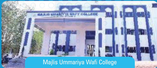
Majlis Ummariya Wafi College