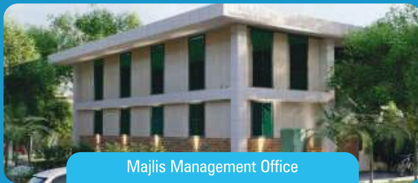
Majlis Management Office