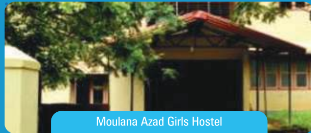
Moulana Azad Girls Hostel