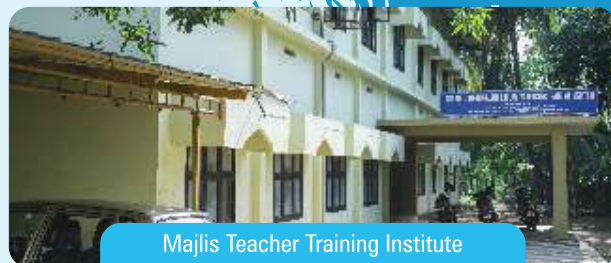
Majlis Teacher Training Institute