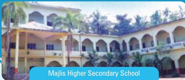
Majlis Higher Secondary School