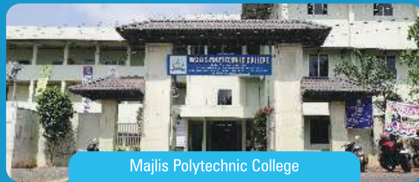
Majlis Polytechnic College