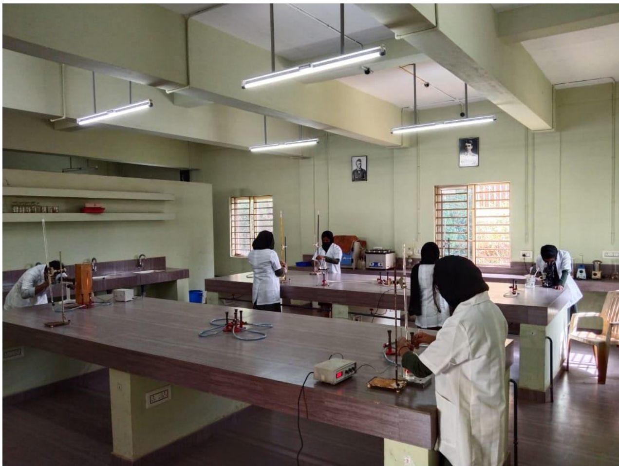
PG Chemistry lab extension completed