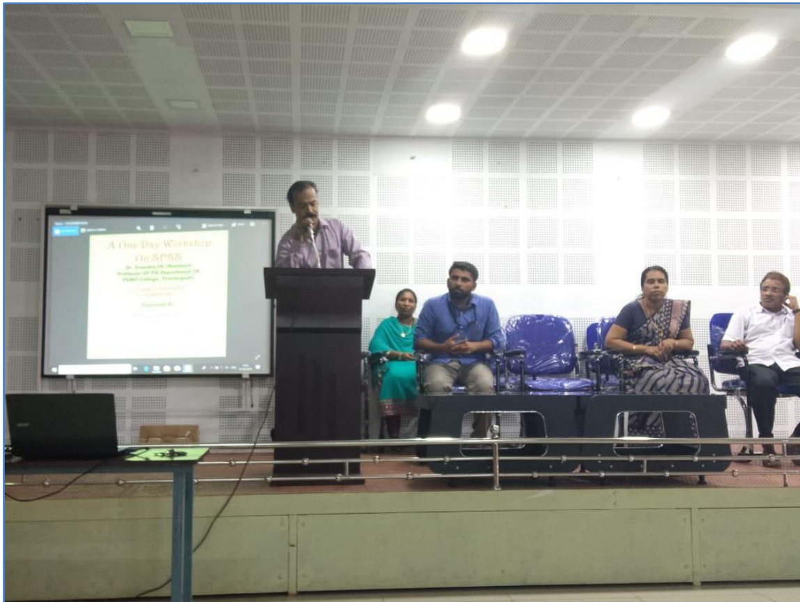
Research Methodology workshop organized by PG department of Commerce On 15/03/2018