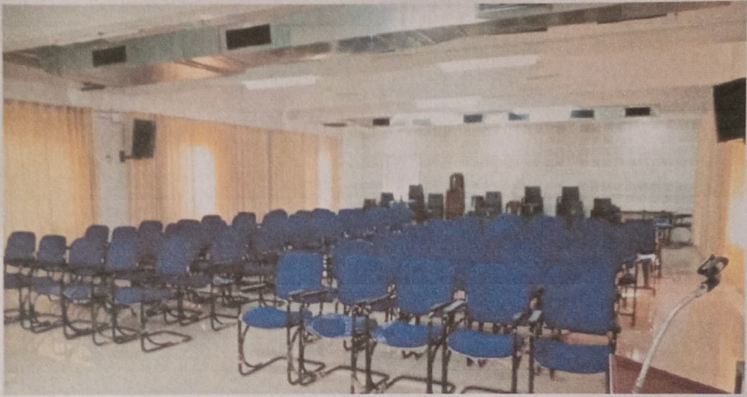
Audio visual Hall Inaugurated