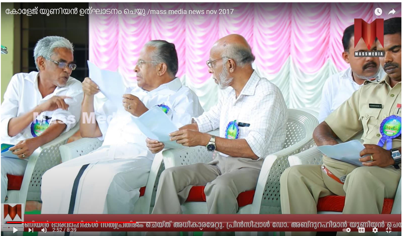
College Student Union Inauguration