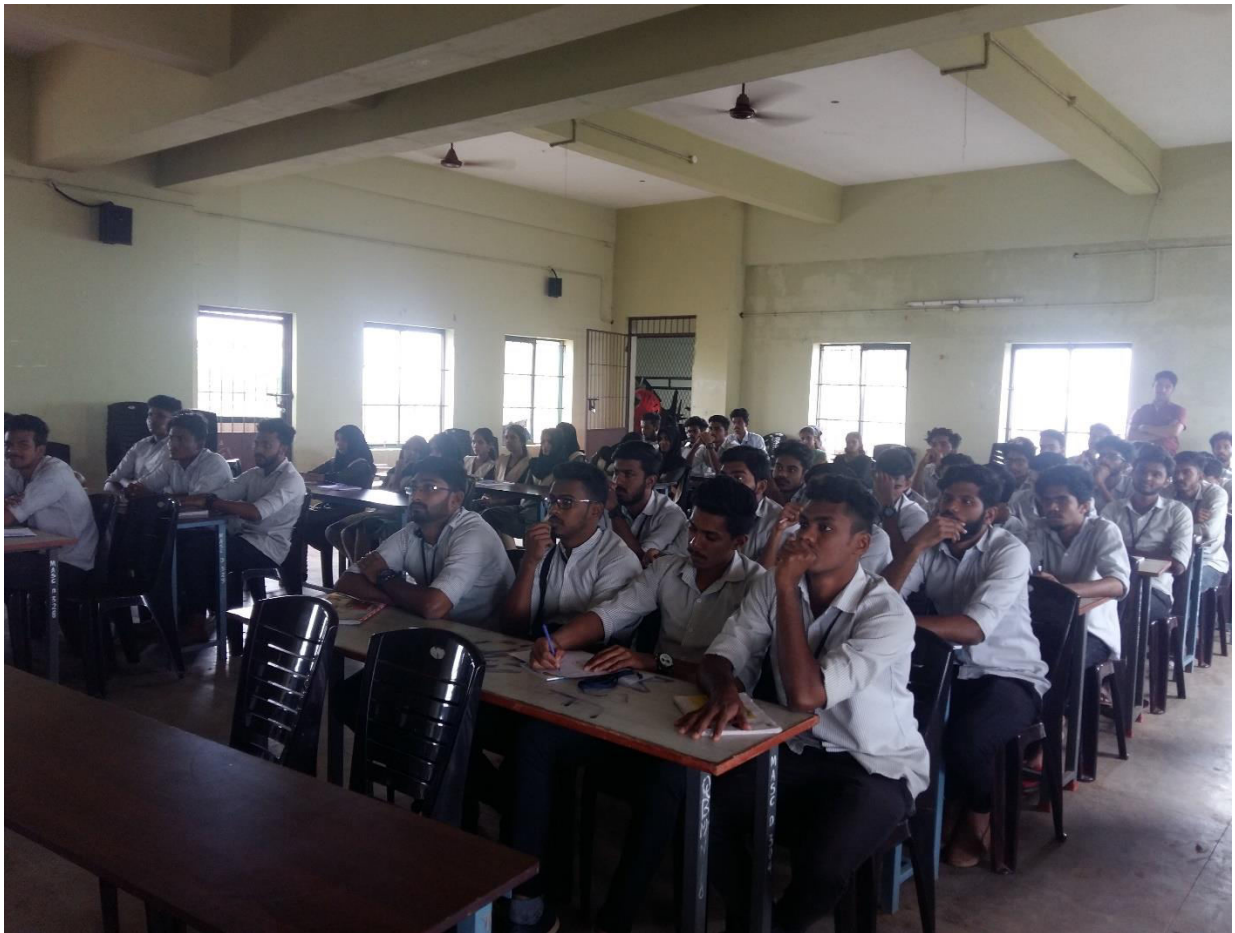
Research Methodology workshop organized by PG department of Commerce