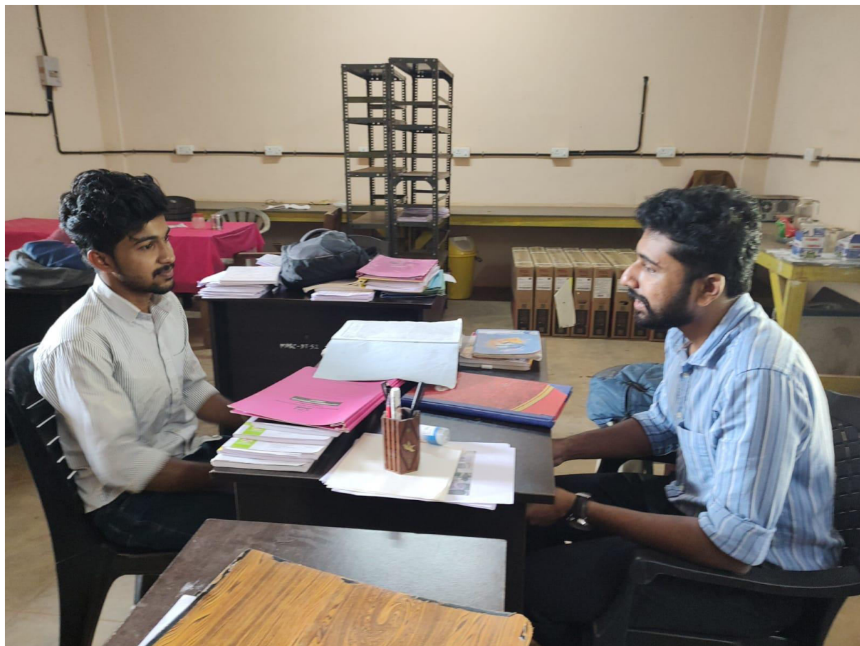
One to One teaching