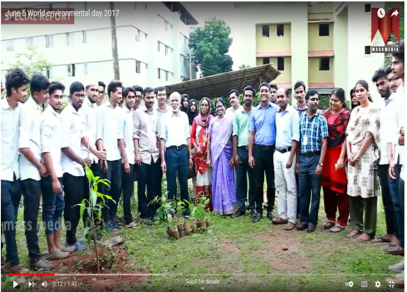
Environment day observation on June 5, 2017