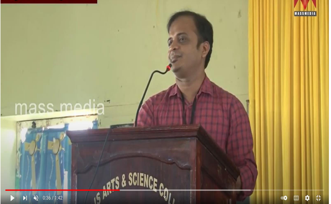
Interaction with Chartered Accountant